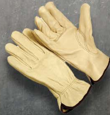
4064 • Standard grain driver, keystone thumb