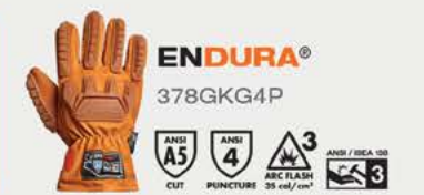
ENDURA® 378GKG4P ANSI A5 CUT, ANSI 4 PUNCTURE, ANSI 3 ABRASION, ANSI/ISEA 1043