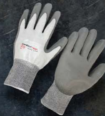
PU372 • HPPE soft fiber, ANSI cut level 2, polyurethane - ANSI: A2 EN4342