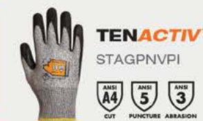
TENACTIV™ STAGPNVPI ANSI A4 CUT, ANSI 5 PUNCTURE, ANSI 3 ABRASION