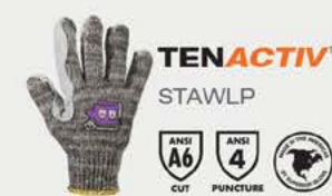
TENACTIV™ STAWLP ANSI A6 CUT, ANSI 4 PUNCTURE