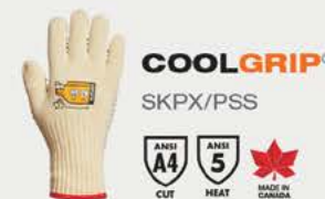
COOLGRIP® SKPX/PSS ANSI A4 CUT, ANSI 5 HEAT, MADE IN CANADA