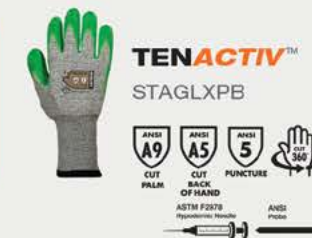
TENACTIV™ STAGLXPB ANSI A9 CUT PALM, ANSI A5 CUT BACK OF HAND, ANSI 5 PUNCTURE, ANSI 3 ABRASION, ASTM F2379, ANSI Puncture