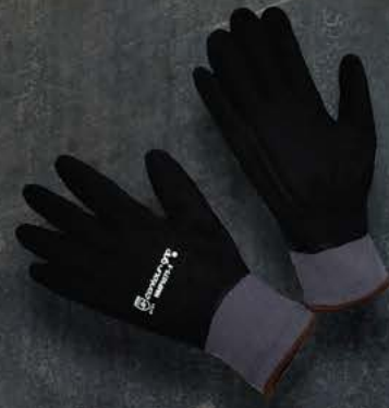
NMF5075 • 15G grey nylon/spandex with black nitrile fully coated