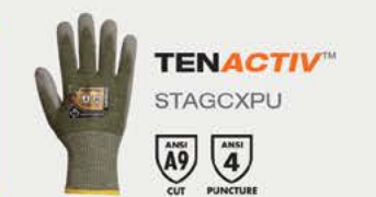
TENACTIV™ STAGCXPU ANSI A9 CUT, ANSI 4 PUNCTURE