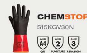
CHEMSTOP™ S15KGV30N ANSI A4 CUT, ANSI 2 PUNCTURE, ANSI 3 ABRASION