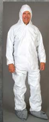
MIC414C • Microporous coverall, hood and boots, elastic wrist