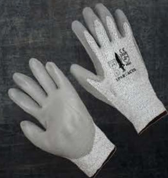
SPARTACUS • HPPE, cut resistant glove, polyurethane palm, cut level A4 - ANSI testing A4 EN388: 4543