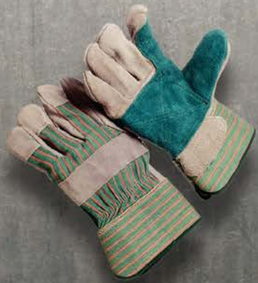
1270P • Green double palm, 2.5" safety cuff