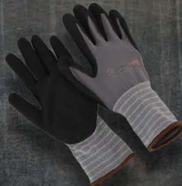
NMF506 • 15G grey nylon, black nitrile micro-foam palm. - EN388:4131