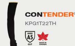
CONTENDER® KPG1T22TH ANSI A5 CUT, MADE IN CANADA